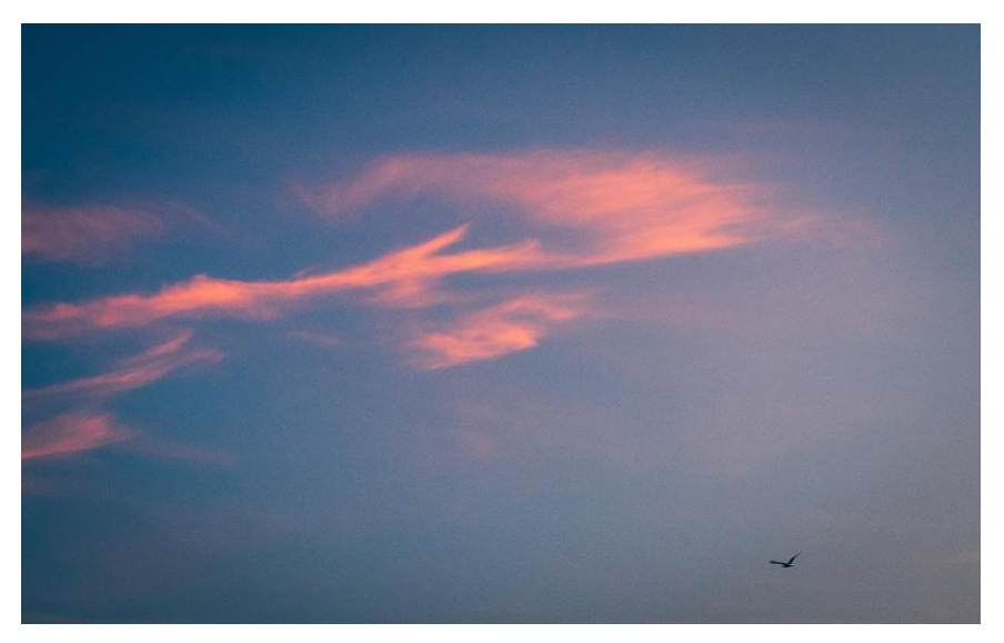
Fig 1: Petrie. 2021. Westward, Door [photograph]