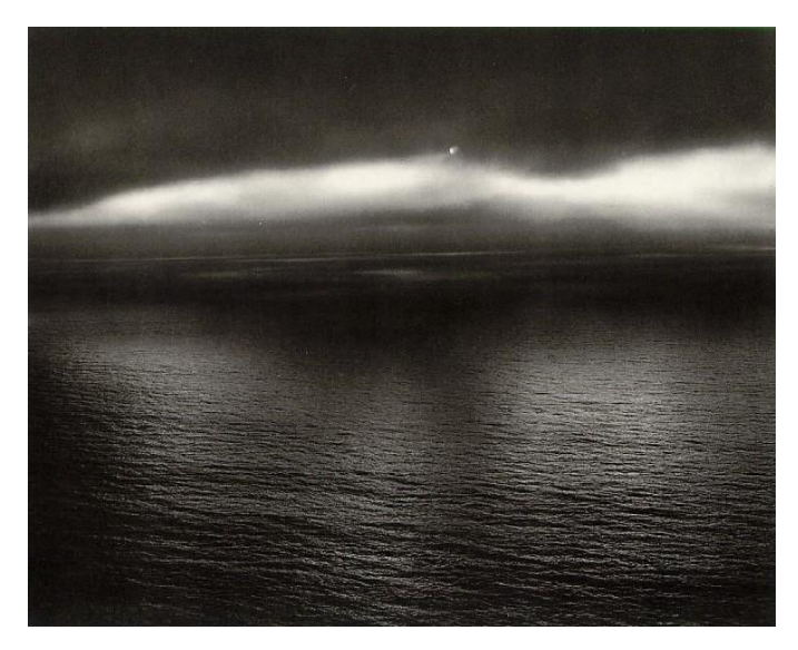
Fig. 9: White 1948. Pacific, Devil's Slide [photograph]