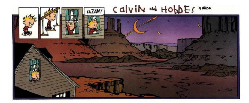
Fig. 2: Watterson 1993. February 28th Sunday Strip [comic]

Calvin shifts into his imagination end with somebody—a parent, his teacher—yanking him back into the real world. He has the power to create vast worlds, but he can only ever skim their surfaces.