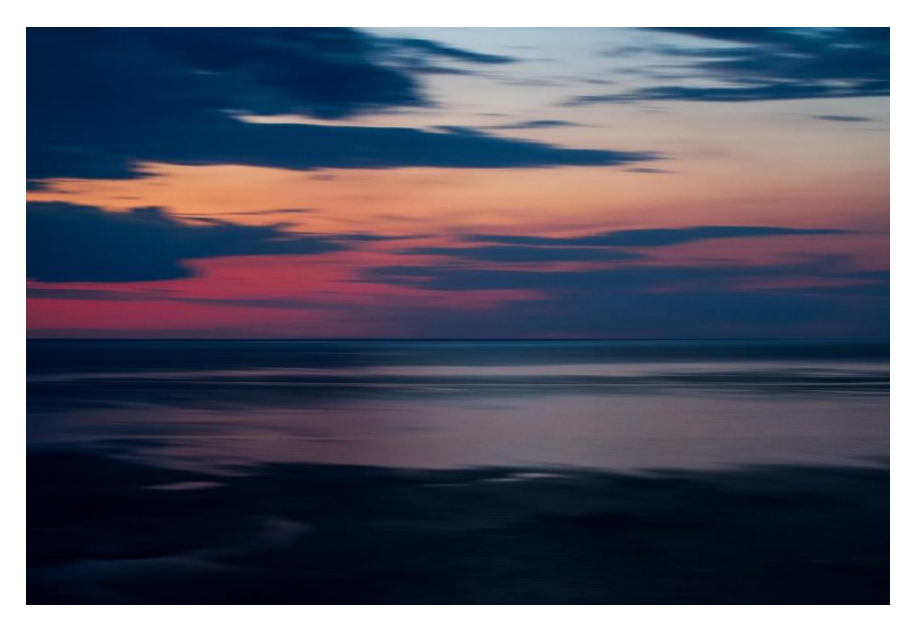
Fig 10: Petrie. 2021. Gloaming, Door [photograph]

Yearning is, in essence, walking the shore. Caught at the edge of a dimming reality, one siphons little hints of life from the vastness beyond. One cannot explore, one cannot know , that for which they Yearn. It is a glance from afar and a world imagined, made sorrowful by distance and evanescence. It is desire and acceptance at once, both a deep longing for what could have been and a gratitude for having been witness: how lucky to have had even the briefest glimpse. There is sadness in knowing an unreachable world exists, but there is also consolation. What is life, after all, without dreams?