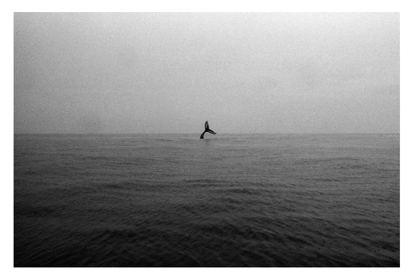
Fig. 8: Levitt 2017. Humpback Whale [photograph]

grainy, hazy obfuscation seems to say, this world existed, somewhere, far and long ago, and you're looking at its last remains.