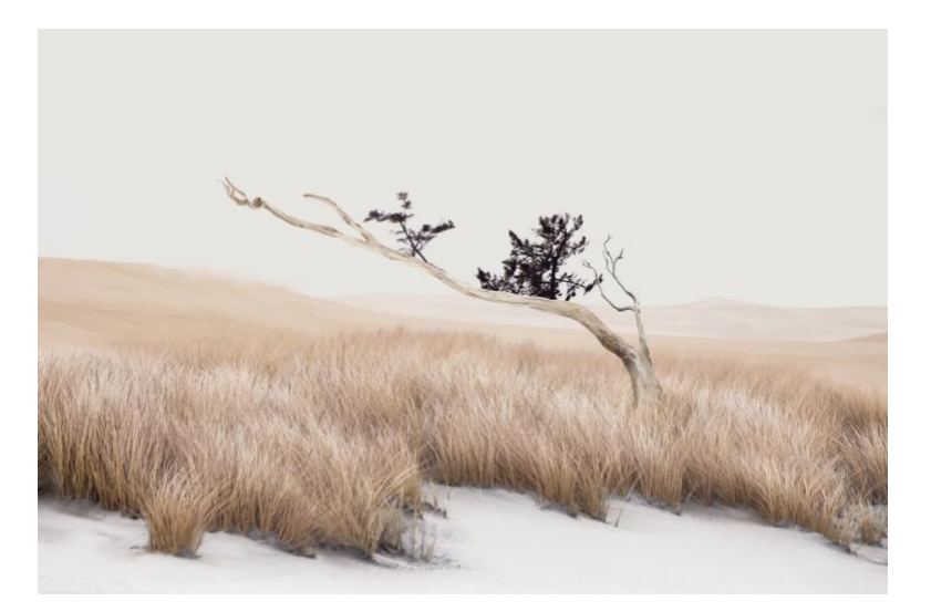
Fig.78: Koublis ca. 2015. Berenices [photograph]

Nowadays, in the depths of the Anthropocene, the only way to honestly depict the wilderness is by depicting the fictional worlds implied by Yearning.